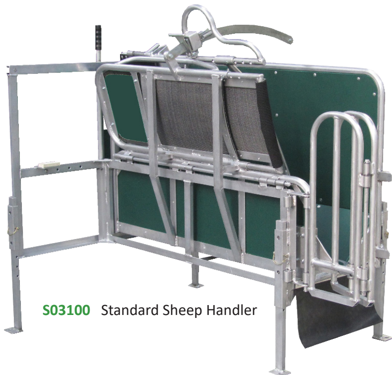
S03100 Standard Sheep Handler