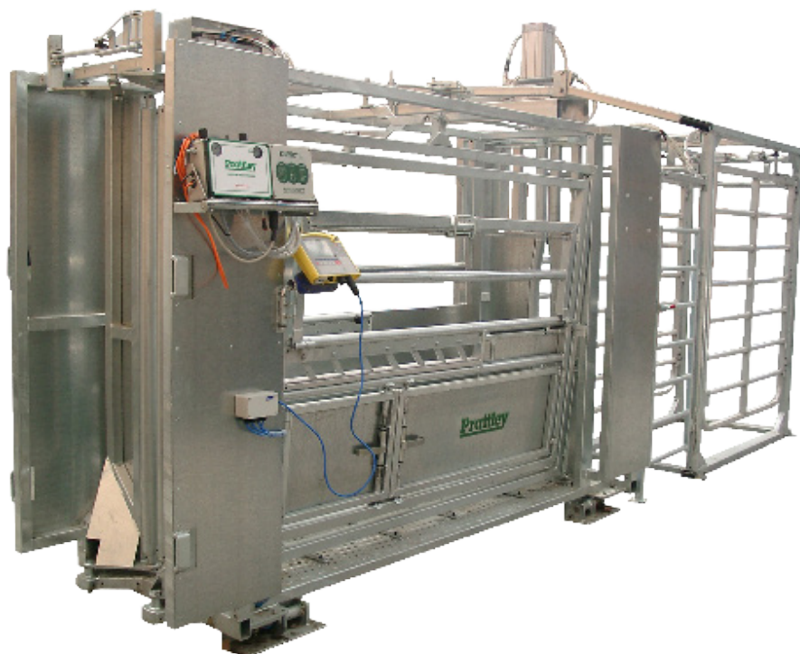
C00800 Permanent Cattle AutoDraft with Diverter Gates